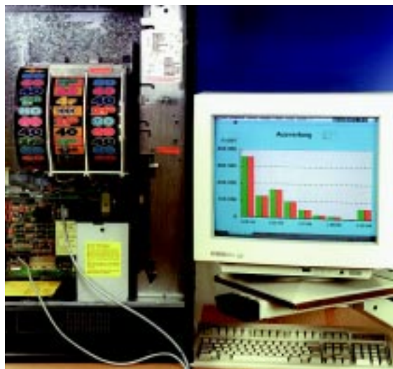
Measurement software controls the cash gaming machine and captures in a «fast-play-mode» approximately three million sets of data

For further information please contact Th. Bronder, fax: (+49 30) 34 81-551, email: thomas.bronder@ptb.de