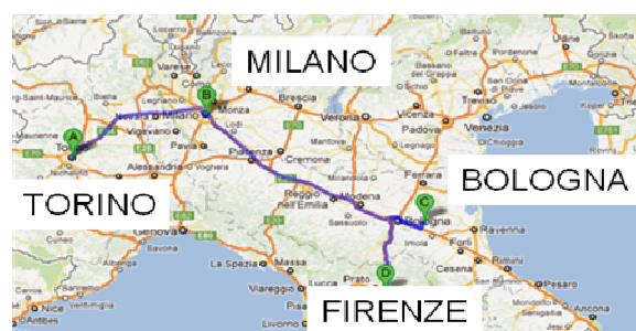
Figure 1: Topology of LIFT, the Italian fiber link project.