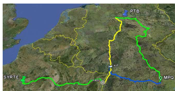
Figure 3: Novel fiber link between OBSPARIS and PTB. This link (yellow) will allow clock comparisons at the highest level.